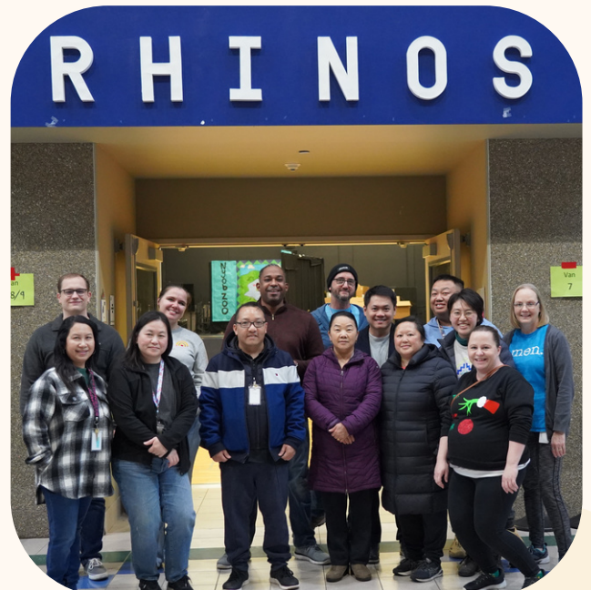
Our Toys for Tots Team!